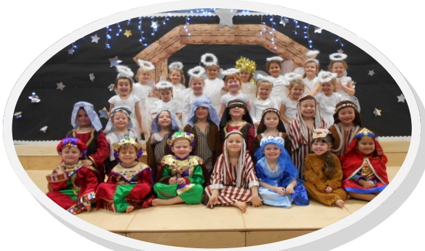
Foundation Stage 'A miracle in Town'

We hope you enjoyed all the Christmas performances.