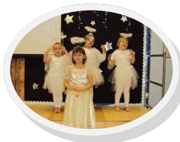
Key Stage 1 - A Midwife Crisis