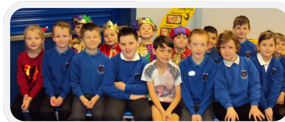
Key Stage 2 - Traditional Carol Services